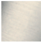
platinum matte 83 500 809-06