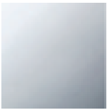
polished chrome 83 500 809-00